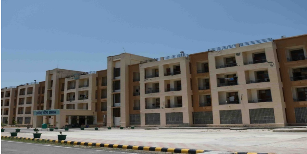
Laxmi Bai Girls Hostel