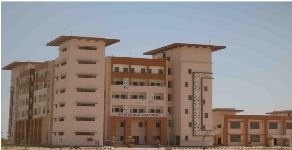
Chhatrapati Shivaji Chhatrawas for Boys